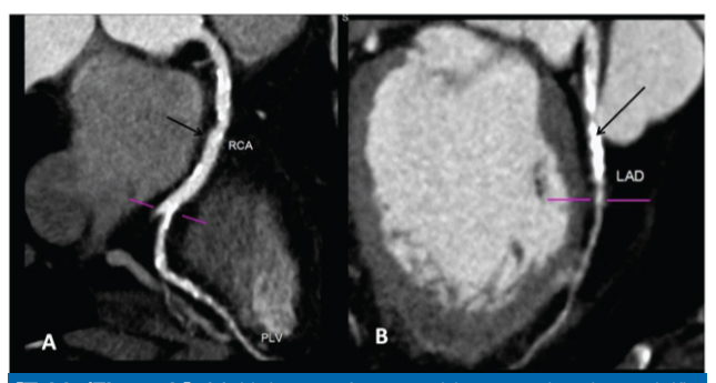
[Table/Fig-4a,b]: Multiplanar reformatted images showing calcific and mixed plaques involving right coronary artery and proximal left anterior descending artery causing significant stenosis of left anterior descending artery (black arrows).